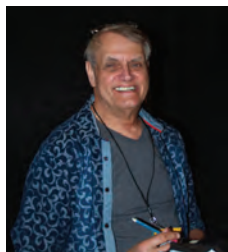
Trimpe in April 2015 at the East Coast ComiCon.